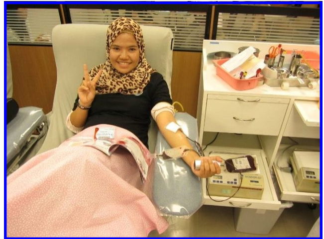
ABOVE: A YESTA member is smiling knowing that her blood donation will make a critical difference in someone's life.