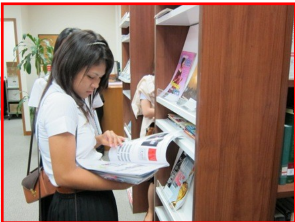
ABOVE: An Ubon Ratchathani student flips through one of the many magazines the IRC has to offer.

RIGHT: The Kindles and iPads were a big hit among the visiting students.