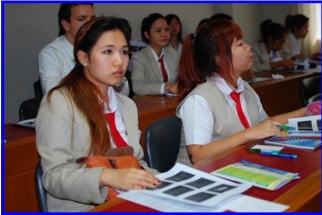
ABOVE: Siam University Hotel and Tourism Management students expressed great interest in participating in the Work and Travel Program.