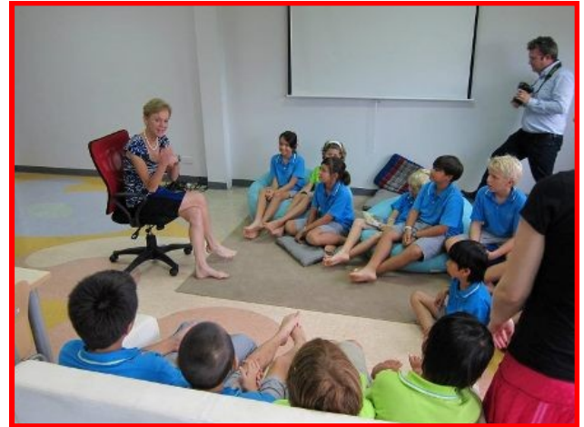
ABOVE: Ambassador Kenney speaks with young students from Phuket International Academy Day School.

Throughout the day Ambassador Kenney discussed various issues with the local press. The expat press was particularly concerned with safety and security issues, which the Ambassador had the occasion to address in her afternoon meeting with the provincial police commander. During an end-of-day