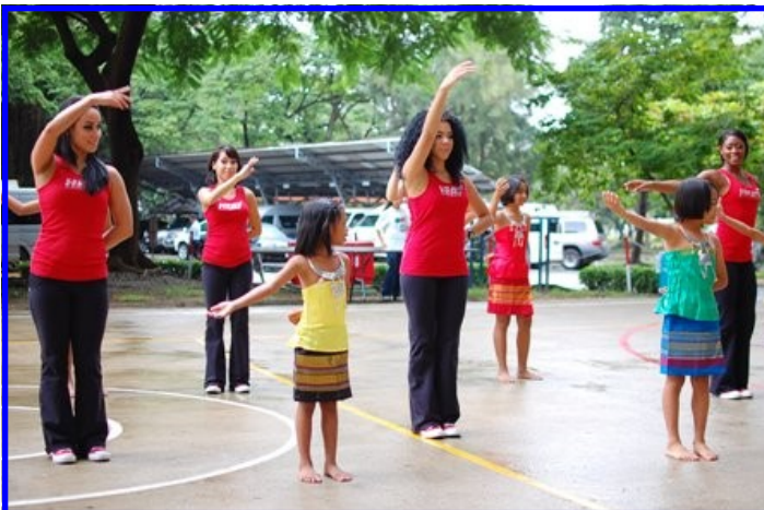
LEFT: The Abundant Life Home girls introduce the Miami Heat Dancers to traditional Isaan (Northeastern) Thai dance.